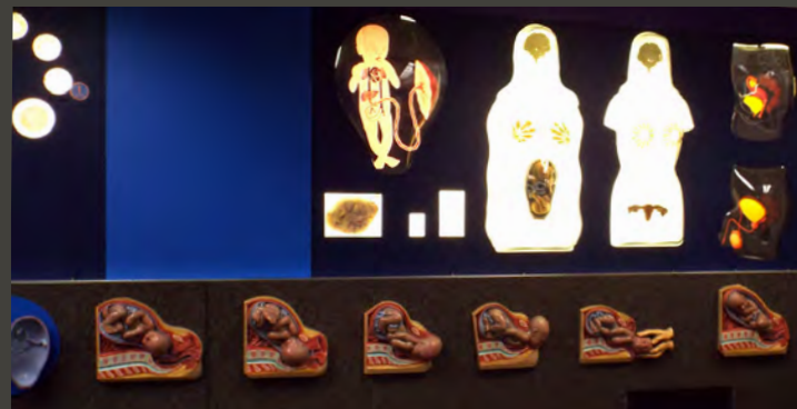
Reproductive system display, Cleveland Museum of Natural History

Because health is "ever-evolving," she adds, the content of classes and the methods used to present it have to change, too. So whether a new prop is needed or recent studies demand new instructions for elementary-school hygiene students, creativity and effective re-design stay important to the museum's education department.