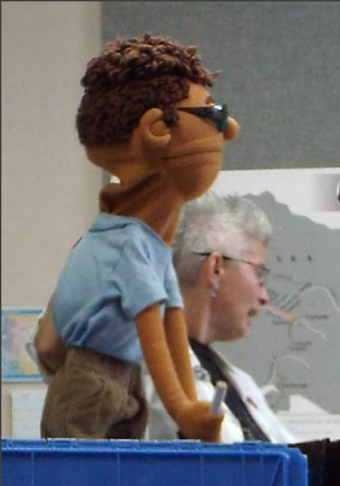
Bob the "blind" puppet

with colored powder that sticks to the places where bacteria have gathered.