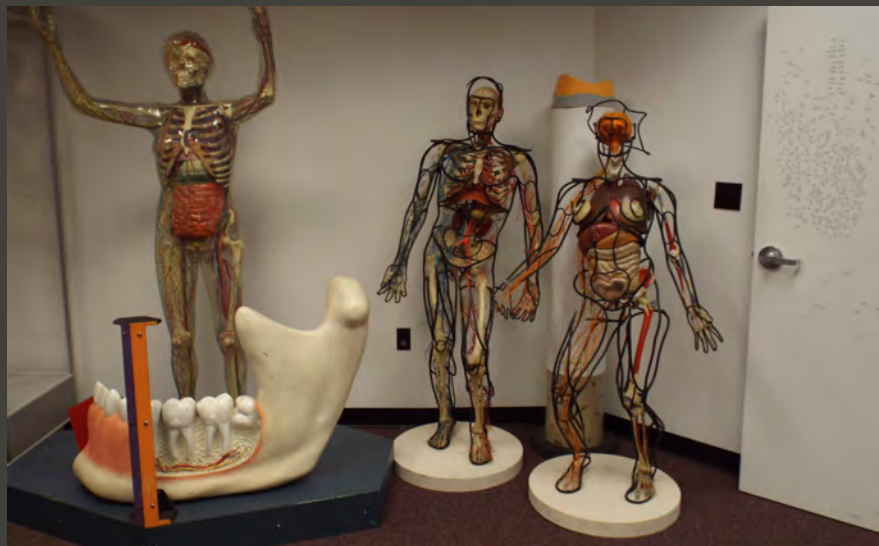
Skeletal display, Cleveland Museum of Natural History

Because health is “ever-evolving,” the content of classes and the methods used to present it have to change, too.