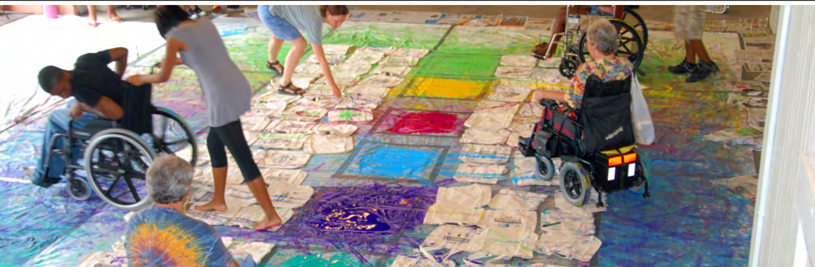
WheelArt – Wheelchair artists roll through colorful pools of paint to create unique designs on fabric using their wheels as paintbrushes.