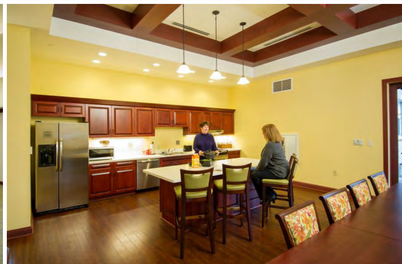
Left: Ames Family Hospice House great room Right: Ames Family Hospice House family kitchen