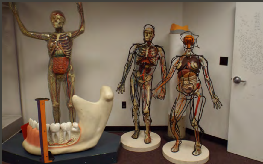
Skeletal display, Cleveland Museum of Natural History

Because health is “ever-evolving,” the content of classes and the methods used to present it have to change, too.