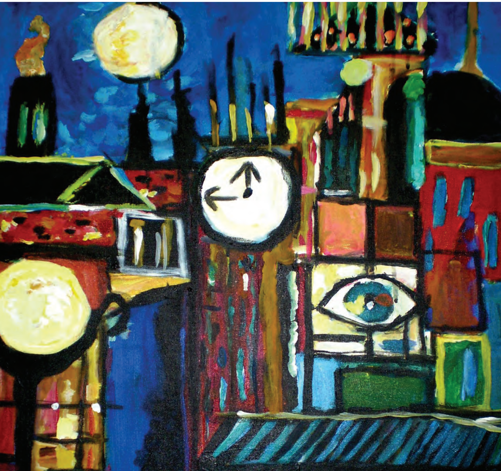
"CityScape" by Scott Mars, a participant in the Art Therapy Studio's community art program