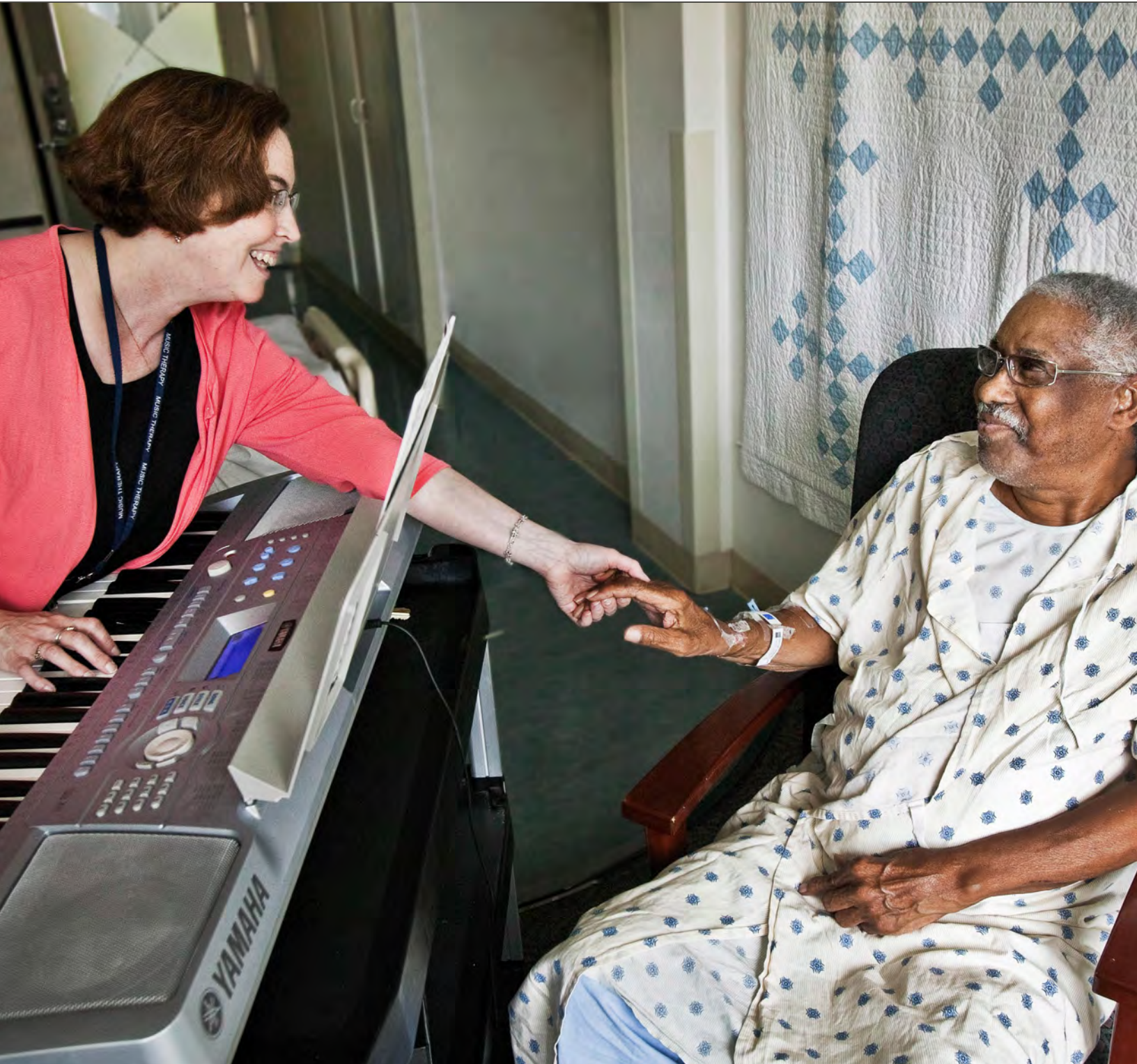
At Cleveland Clinic, board-certified music therapists treat patients to improve symptoms and conditions associated with illness and injury. Music therapy has been shown to decrease pain and anxiety, and improve quality of life, mood, and speech.

cleveland clinic arts and medicine institute