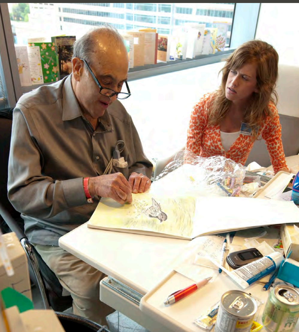
Left: Art therapists facilitate the creation of art by patients to assist with the emotions, stress, and anxiety experienced in the hospital setting. Programs are offered bedside and in groups, for patients and families.