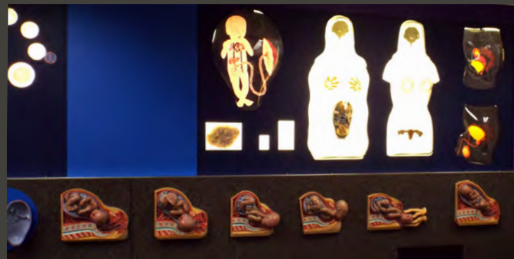
Reproductive system display, Cleveland Museum of Natural History

Because health is “ever-evolving,” she adds, the content of classes and the methods used to present it have to change, too. So whether a new prop is needed or recent studies demand new instructions for elementary-school hygiene students, creativity and effective re-design stay important to the museum’s education department.