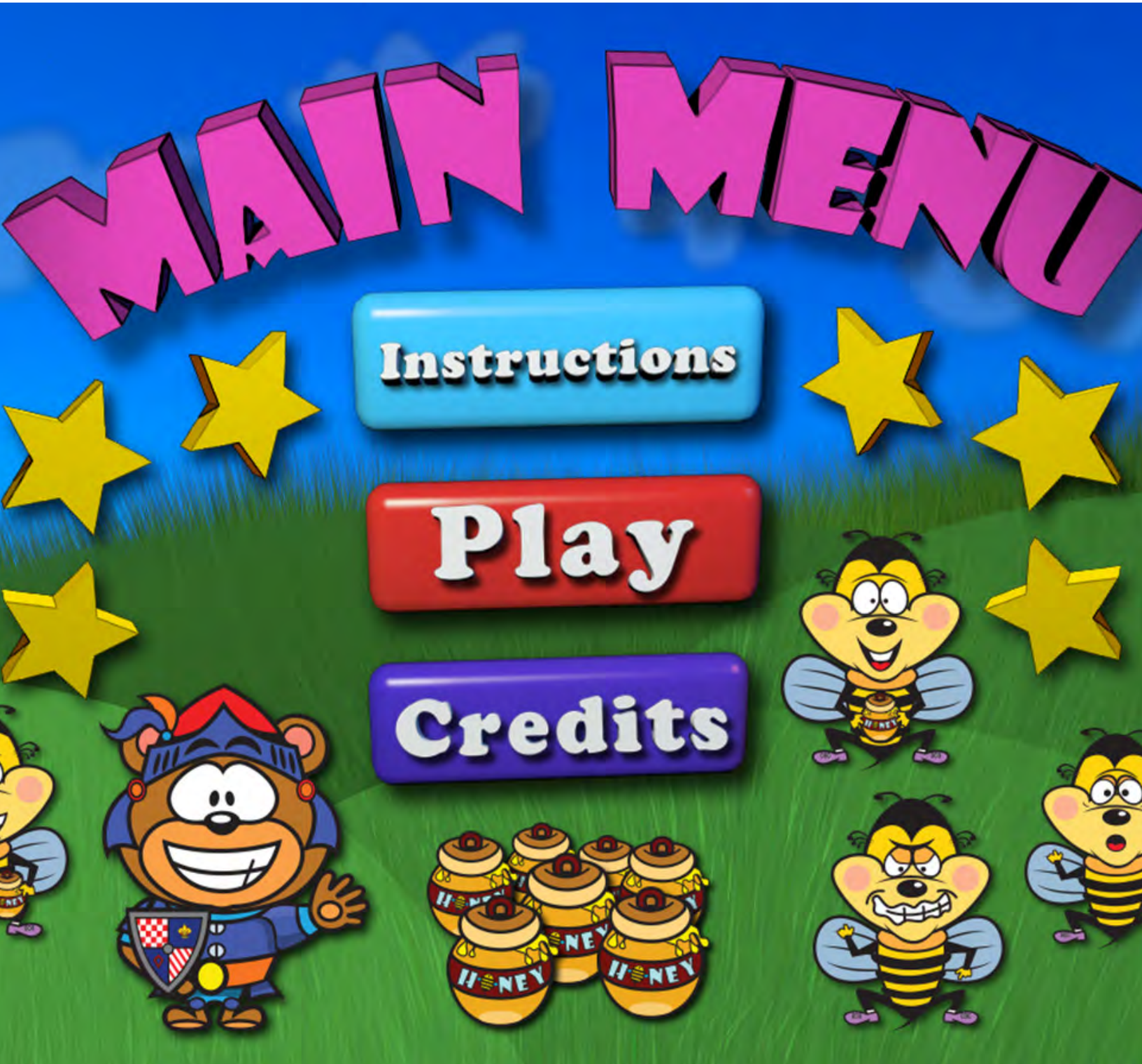
Billy Bear's Honey Chase Main Menu