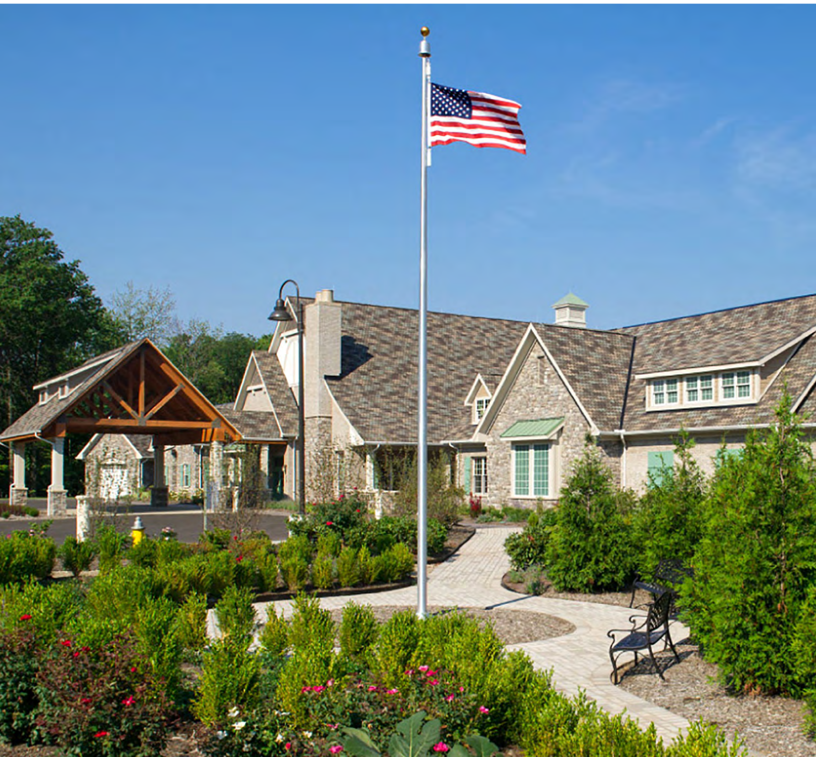
Ames Family Hospice House Exterior